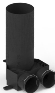
Pressure loss dependence on air

Made of a material with antistatic characteristics, no dust settles on the walls of the box, used for connecting air supply and air exhaust distributor. Diffuser connection ends can be easily adjusted as needed. Double locking system, easy to install. Comes with a cardboard mounting template (stencil), cardboard blind DN125, and wire clamps.