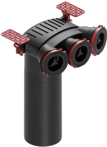
Pressure loss dependence on air

Diffuser connection box allows the connection of up to 3 75 mm ducts to a 125 mm supply/exhaust air diffuser. Complete with a set of plugs and gaskets. Constructed from high quality polypropylene.