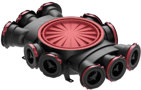
Pressure loss dependence on air

Distribution box is responsible for the supply of fresh air to or the extraction of dirty air from different rooms in a building. The system components are made of extremely light yet durable plastic material ensuring reliable operation for years, without the risk of mechanical damage or corrosion. More importantly the construction material used (PP – polypropylene) is considered safe as it poses no health hazard and is 100% recyclable.